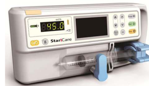
HY-900B Syringe Pump